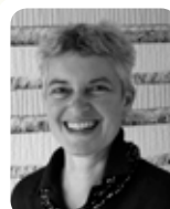
Textile Artist and Designer/maker